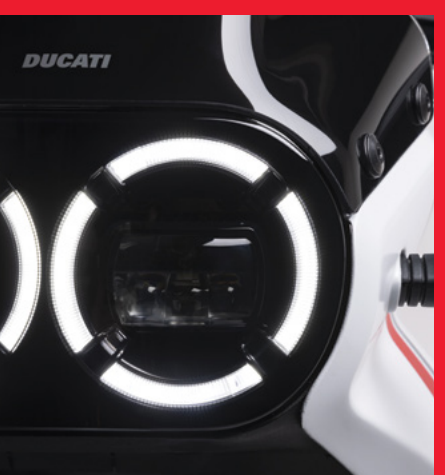
Full LED headlight with DRL